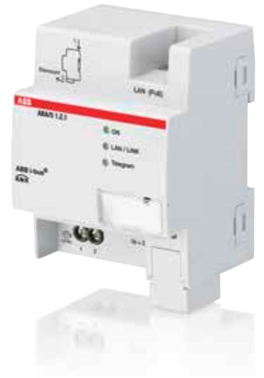
ABB i-bus® KNX Logic Controller ABA/S 1.2.1, 2CDG110192R0011